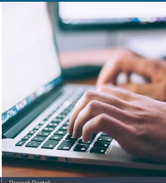
Project Portal: https://softmob.pixel-online.org/index.php